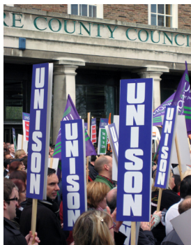
There is more information on the cuts on page 2

“It is now clear that the promises to protect front line services were lies.”