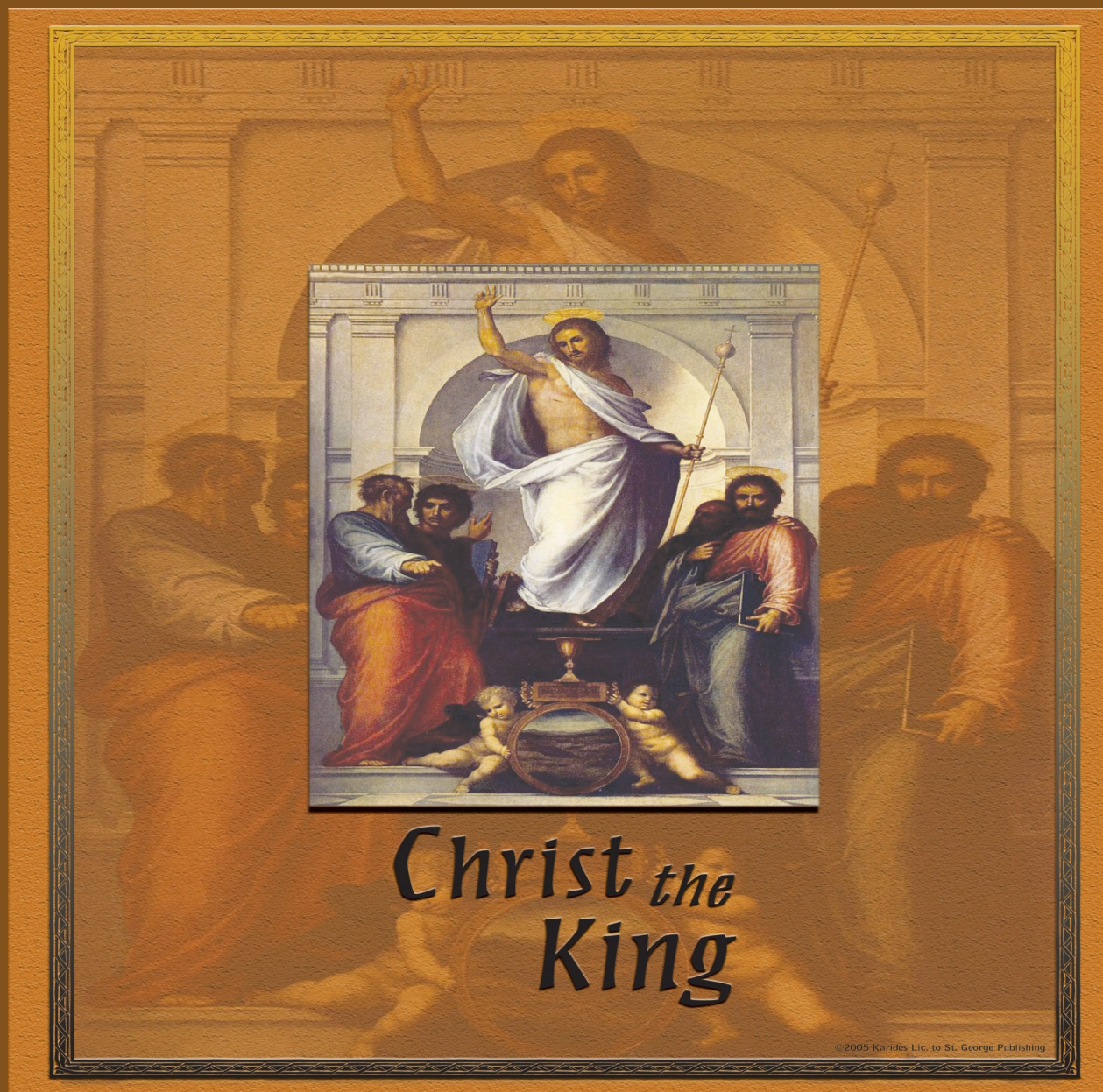
Christ the King