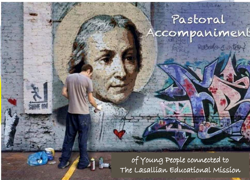
of Young People connected to The Lasallian Educational Mission