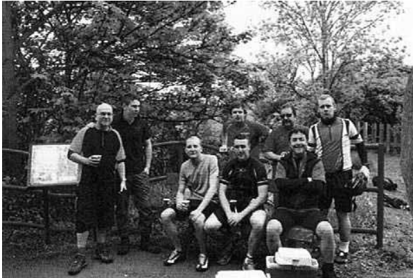
The Trans Pennine Trail team from National Grid North West 2 who raised £5274 for LIVERNORTH.