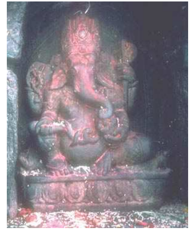
Ganesh in temple covered with ghee butter and sienna offerings similar to the story.

"I saw a sight one day that made my heart ache, ache for the boys and girls of India, and which I desire to picture to the boys and girls of the dear home lands, to see if they will not lend a vigorous hand in soon making such things impossible in all of idol-ridden India.