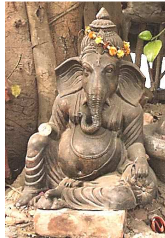
More clear picture of "Ganesh" statue in front of tree.