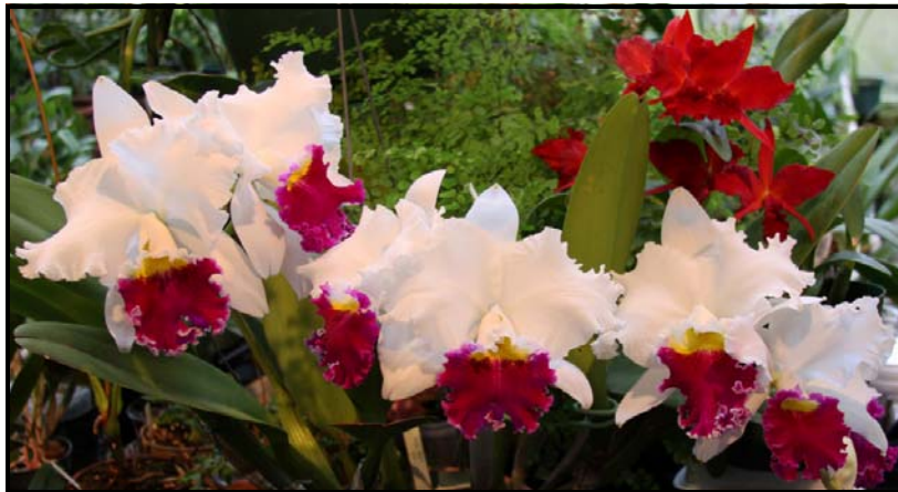
Trophy Winning Cattleya Orlade's Grand