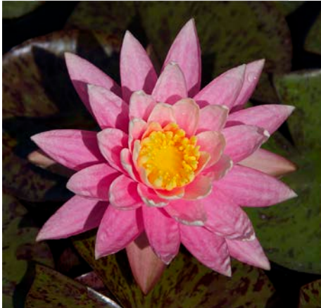
IWGS 1 st Place People's Choice Hardy Water Lily 'White Hot'