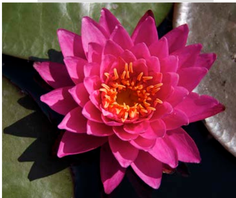
IWGS 2 nd Place Tie People's Choice Hardy Water Lily 'Kotchanat'

Everyone always has a great time and the White Elephant Gift Exchange is very popular as well. Please bring a guest and kick off the holiday season in style and plan on attending the Holiday Banquet!