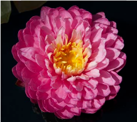
IWGS 1 st Place New Hardy Water Lily & 2 nd Place Best New Water Lily 'Manickam' , (photo courtesy of Tamara Kilbane)