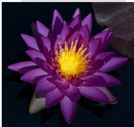
IWGS 2 nd Place Intersubgeneric Hybrid Water Lily 'Amaranthine' , (photo courtesy of Tamara Kilbane)