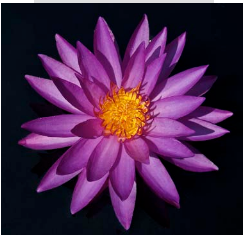
IWGS 2 nd Place People's Choice Intersubgeneric Hybrid 'Detective Erika' , (photo courtesy of Tamara Kilbane)