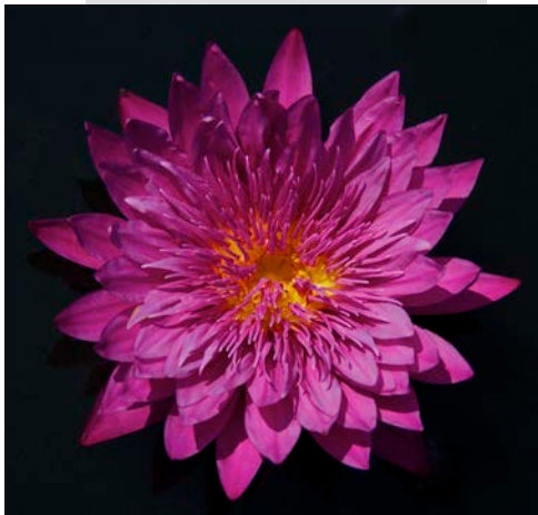
IWGS 1 st Place New Tropical Water Lily 'Valentine'