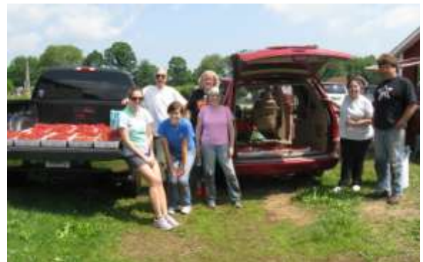
Our Strawberry Pickers