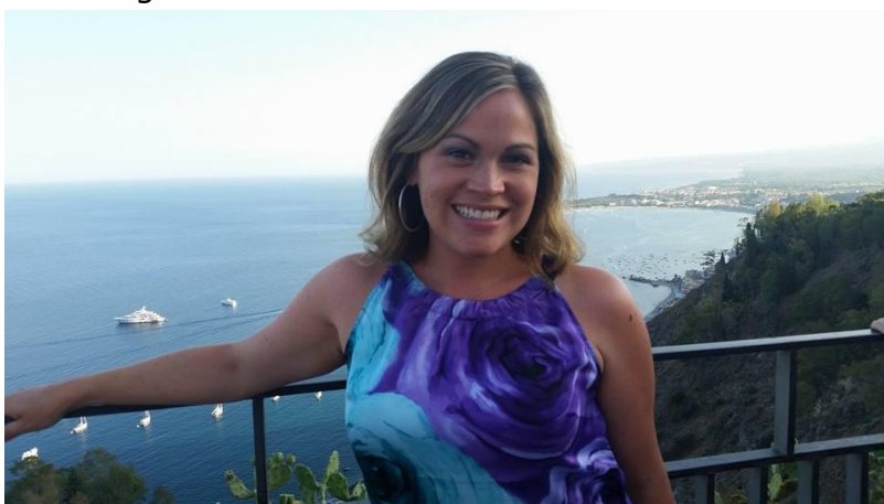
Second Grade Teacher

I have been in District 54 since 2001. I taught at both John Muir Elementary and Fairview Elementary before arriving here at Hoover last year.