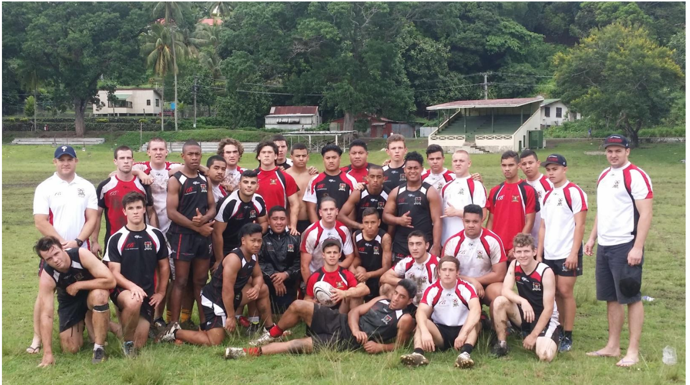
The 2014 Junior Academy team at a training session in Levuka (Fiji) in December 2014