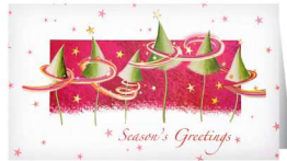
Trees & swirls