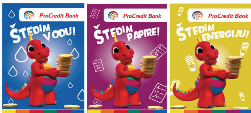
Fig. 5. Proki corner

Other elements on the homepage that should be mentioned are search windows, used by visitors and potential clients as a shortcut to content they are interested in, as well as exchange rates, reference rate, real estate offer, latest news, info center phone numbers, and contact e-mail.