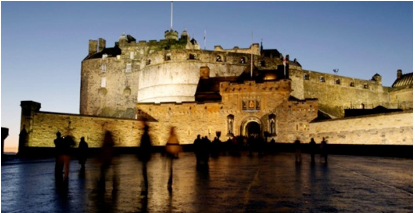
Edinburgh castle photographed from the Esplanade.

In Edinburgh you could visit Edinburgh Castle, climb up the Scott Monument or stroll along the shops on historic Princes Street. There's just so much to do and see!