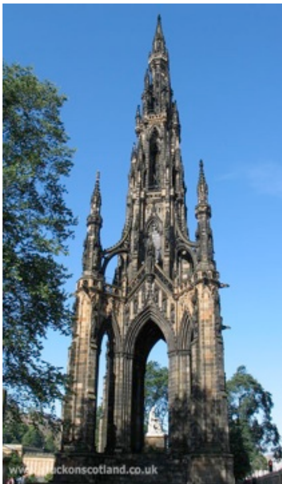
The Scott Monument