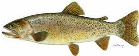
Snake River Cutthroat Trout