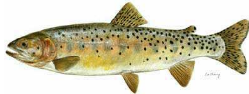
Bonneville Cutthroat Trout