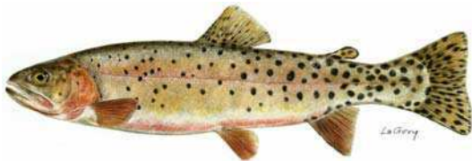
Colorado River Cutthroat Trout