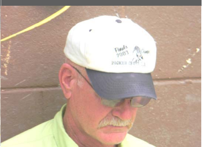
on the job. He don't play that. WAKE UP!!!!