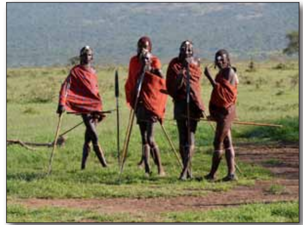
Above, Maasai "Morani" (warriors). Below, three cheetah brothers. Bottom, migrating herd in Serengeti National Park.

Depart Ngorongoro Crater this morning for the three-hour drive back to Arusha, including a game drive in Lake Manyara National Park. In Arusha, we will stop at the Cultural Heritage Center for a hot buffet lunch and an opportunity to shop. Transfer to the African Tulip Hotel where we have reserved dayrooms to relax, freshen up, and do any final packing. Gather for a farewell dinner to celebrate the end of our adventure, and then transfer to Kilimanjaro airport for return flights homeward. (B,L,D)