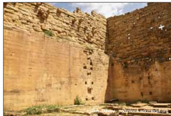
Above, interior of the Temple of the Moon, Yeha. Below (2), Bet Giyorgis church, Lalibela. Bottom, Yemrehane Christos, a church built inside a cave near Lalibela.

Depart Addis Ababa today en route to Arusha to begin the main safari program. (B,D)