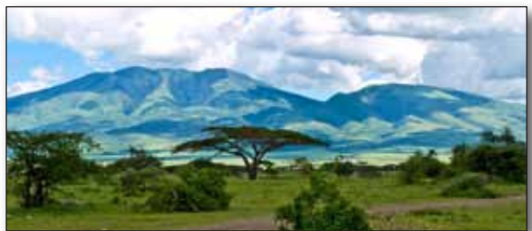
Above: Morning on the Serengeti. Below: Crested Cranes. Bottom: African Elephants.