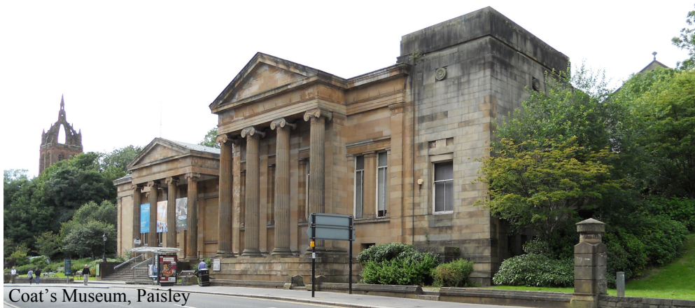
Coat's Museum, Paisley