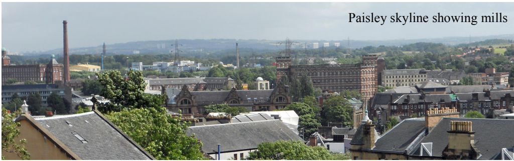
Paisley skyline showing mills