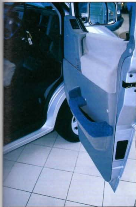
Cloth trim on the doors is part of the VW cab Comfort Pack.

The last T4s have already rolled off the production line in Germany. Don't expect T5-based motorcaravans just yet, though - we first have to wait for right-hand drive and then for the motorhome industry to do its stuff. Auto-Sleepers hope to launch one short wheelbase T5 conversion at Earls Court in November, but long wheelbase and coachbuilt models will take longer.