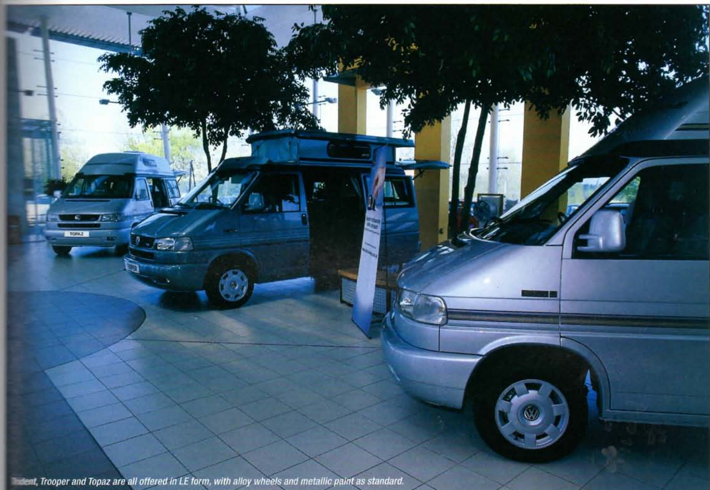
Trident, Trooper and Topaz are all offered in LE form, with alloy wheels and metallic paint as standard.