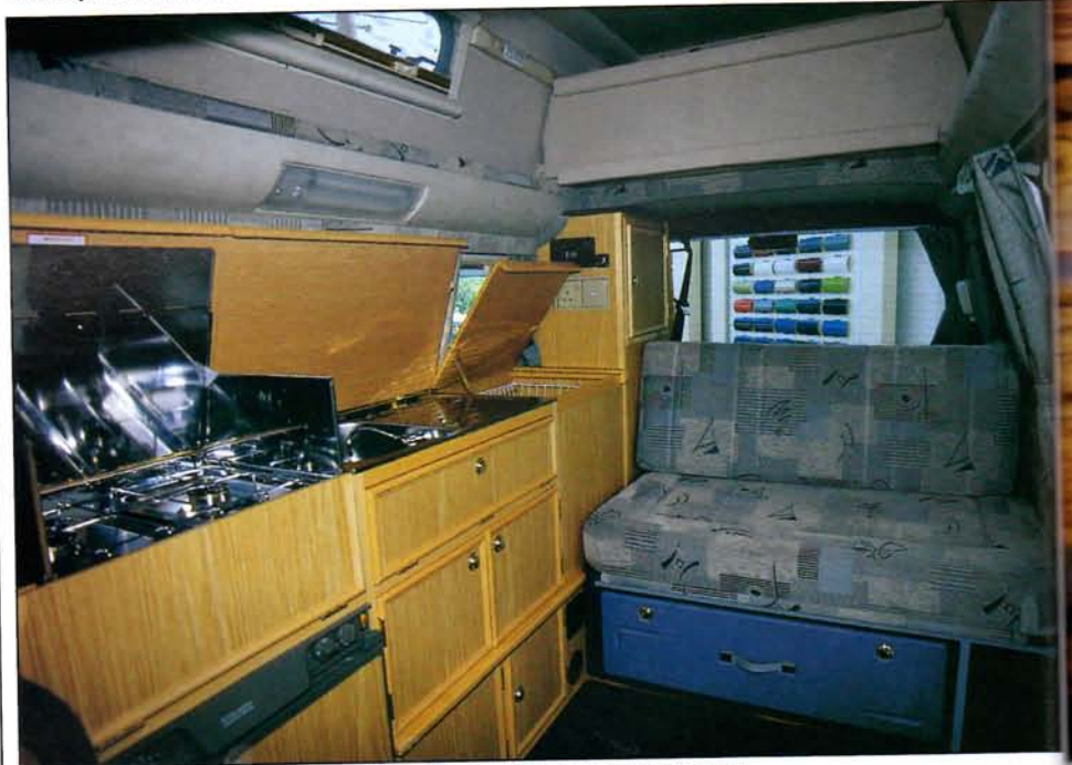
Traditional Auto-Sleeper interiors are enhanced by diesel-fired heating as standard.

Estate, Humberston, Grimsby DN36 4BG (01472 811036); Pullingers Leisure Vehicles, 11 First Avenue, Bluebridge Industrial Estate, Halstead, Essex CO9 2EX (01787 472747); and Southern Motorhome Centre, Leisuretrack Centre, Bath Road, Taplow, Maidenhead Berkshire SL6 0NX (01628 660888).