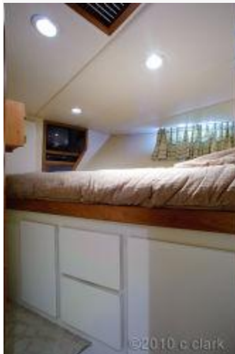
Guest Stateroom Stbd