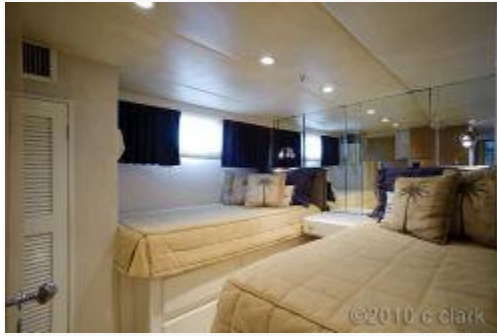
VIP Guest Stateroom