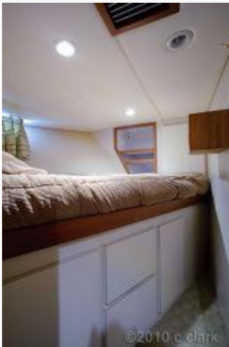
Guest Stateroom Port