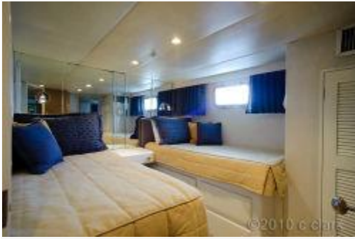
VIP Guest Stateroom