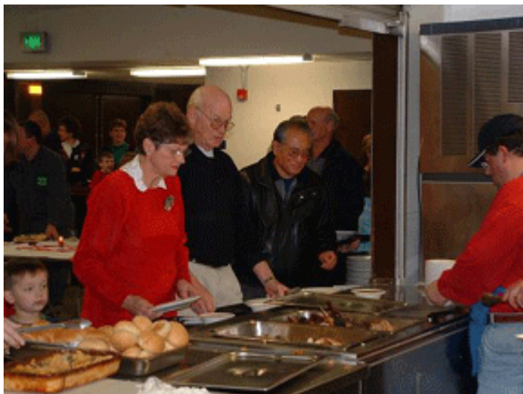
Where's the food....