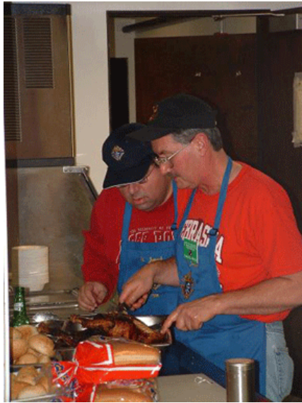
I know I dropped it here somewhere