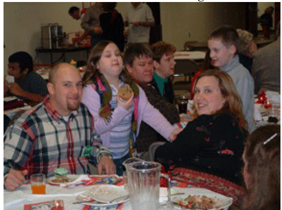
We're having fun now...