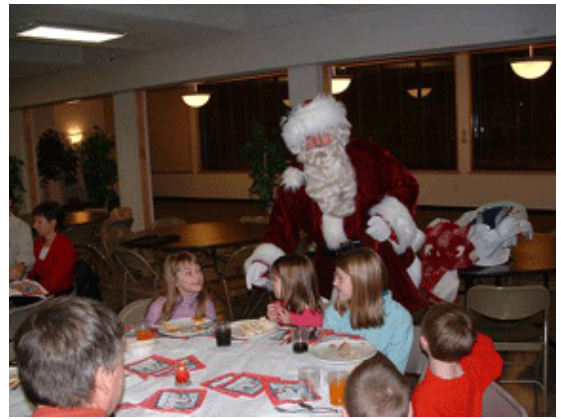
There's old Jelly Belly...