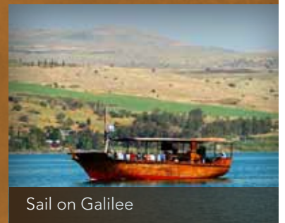
Sail on Galilee