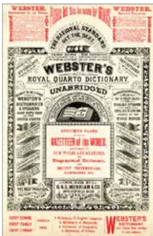
Webster's Dictionary of 1864: Invention of the Modern Dictionary August 12, 6:30 PM Central Library