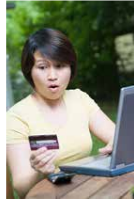
Identity Theft, Elder Fraud, Tenancy Rights Presentations at Indian Orchard, East Forest Park and Brightwood Branches