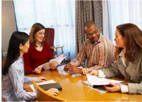
Job Seeker Support Workshops August 4, 11, 18, 25, 6:00 PM Sixteen Acres Branch Library