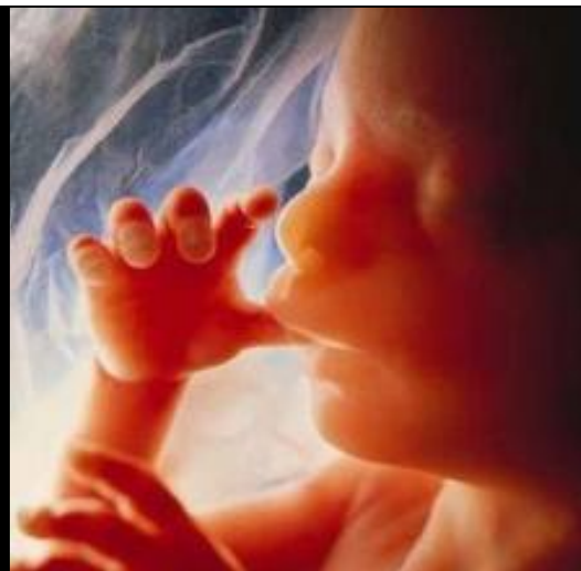
This is NOT Considered LIFE on Earth

“You saw me before I was born. Every day of my life was recorded in your book. Every moment was laid out before a single day had passed”