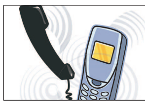
25 HIGH-END ONES ORDERED

Bangalore: Ministers and their aides appear to be constantly weighed down by pinging mobile phones; many even juggle two or three with elan. But mantris manage more — for better communication, they prefer land-line phones, which will cost the government Rs 7.24 lakh.