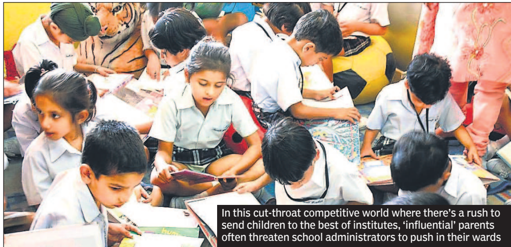
In this cut-throat competitive world where there's a rush to send children to the best of institutes, 'influential' parents often threaten school administrators to push in their wards