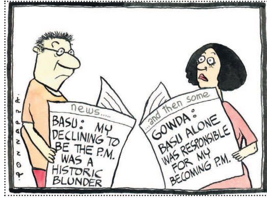
Basu: My declining to be the P.M. was a historic blunder. Gowda: Basu alone was responsible for my becoming P.M.

Now Book a Remembrance adv. at a click. www.ads2book.com Ad Booking Simplified No Extra Charges For more information SMS a2b to 58888