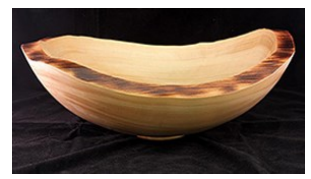
Gerhard Schwenke —Podocarpus