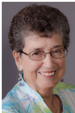
Ladies Auxiliary President