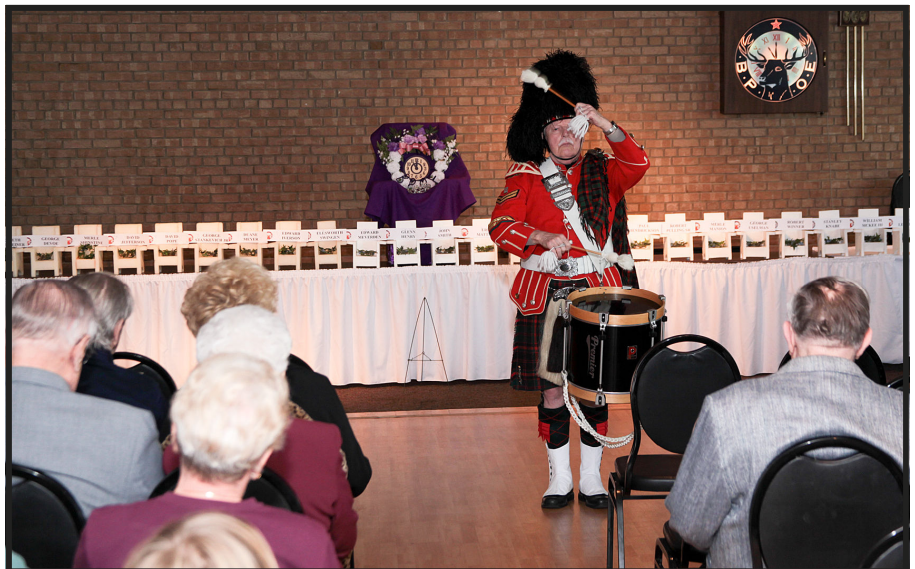
This year's Memorial Service was enhanced by drummer and bagpipes.