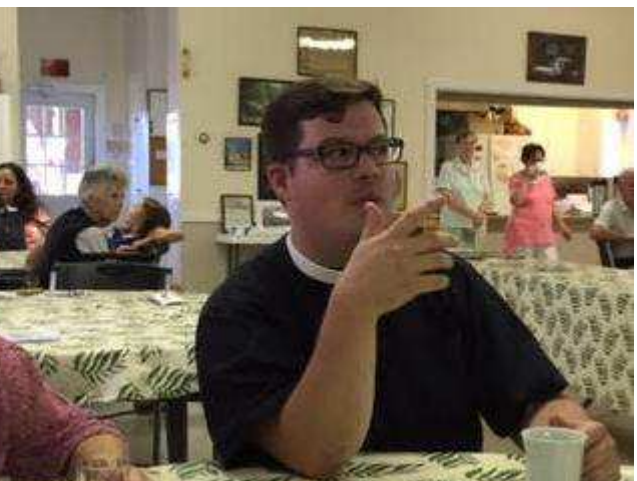
Our visiting priest looked intrigued