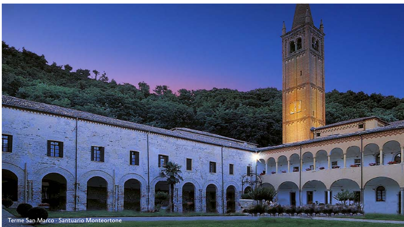
Terme San Marco · Santuario Monteortone

FOR BEGINNERS AND ALL WHO WISH TO ACQUIRE AN IN-DEPTH EXPERIENCE