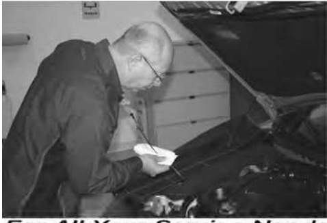
For All Your Service Needs

Your Nissan dealer is a full-service maintenance and repair center. We recommend using authorized Nissan Service and genuine Nissan Parts that we have designed for their reliability, safety and suitability for your Nissan vehicle. We are committed to providing you with quick, efficient, and competitively priced service and parts.