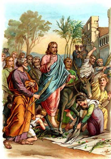
Christ's entry into Jerusalem.

Jesus said to her, "I am the resurrection and the life. He who believes in me will live, even though he dies; and whoever lives and believes in me will never die."