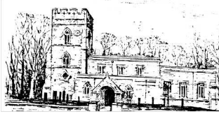
All Saints, Great Addington