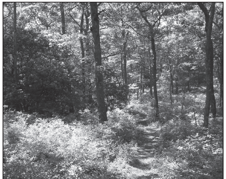
DuVal Hiking Trail