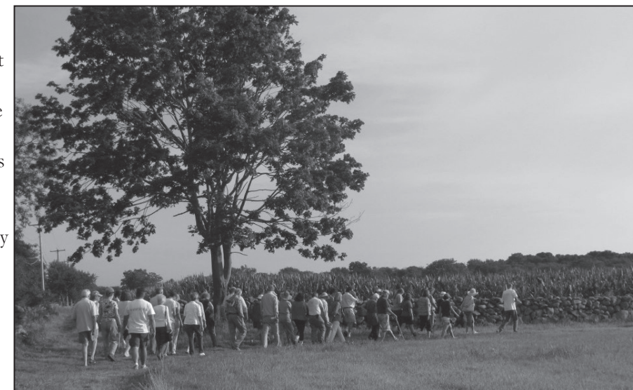
Land Trust Days hike at Weeden Farm in August

SKLT held two events for Land Trust Days. On opening day we partnered with The Nature Conservancy in hiking to the Anna Brewster camp on Long Pond; and