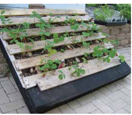
Easy to pick strawberries!

Whether you want herbs or vegetable at easy