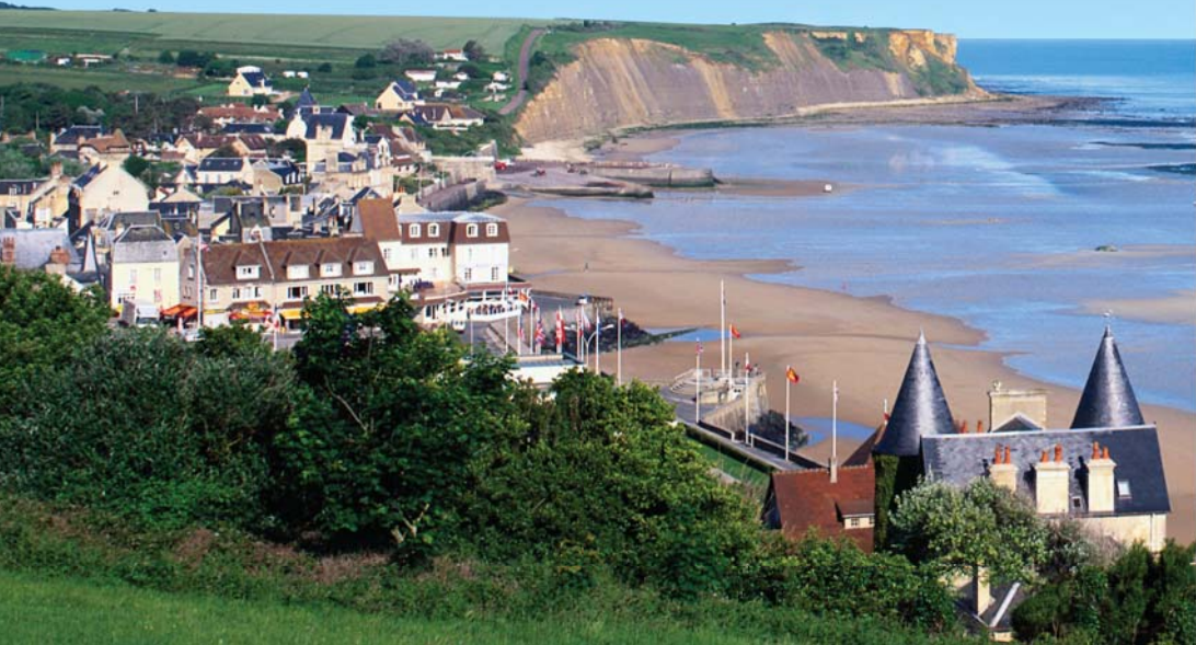
Photo this page: The seaside town of Arromanches overlooks Gold Beach and Mulberry "B," military code names for one of the D-Day beaches and its associated artificial harbor that was used to land troops and equipment.

Cover: Duart Castle on the Isle of Mull, built in the 13 th century, is the seat of Scotland's Clan Maclean.