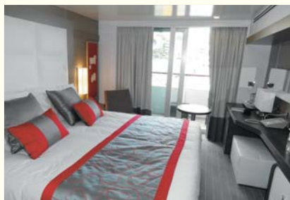
Stateroom with Balcony

The state-of-the-art propulsion system and custom-built stabilizers provide an exceptionally smooth, quiet and comfortable voyage by minimizing vibration and engine noise. By design, the ship is energy efficient and environmentally protective of marine ecosystems, and it has been awarded the prestigious "Clean Ship" rating, an extreme rarity among ocean-cruising vessels. The ship has two tenders.