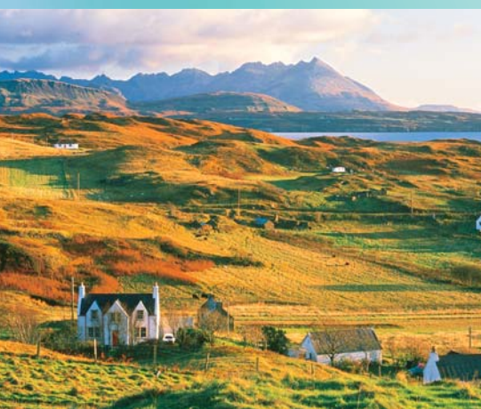
Isle of Skye's rolling moors have captivated generations of visitors to Scotland's Inner Hebrides.

Tour the imposing Caernarfon Castle, an impregnable 13 th -century fortress built by Edward I of England as a defense against