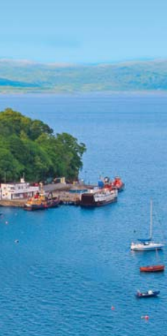
Engaged in the colorful fishing of the Sound of Mull.