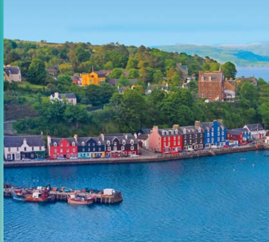
The traditional way of life in the Scottish Isles remains unchanged in the port of Tobermory, where brightly painted houses overlook the harbor.

Guinness in a neighborhood pub or visit the National Museum of Ireland, one of the best repositories of Celtic treasures in the world.