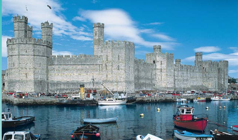
Explore Edward I's impressive Caernarfon Castle, the mightiest link in his Iron Ring of 13 th -century fortresses across North Wales and where Queen Elizabeth II invested Prince Charles of Wales in 1969.

After free time, visit the 13 th -century Duart Castle, the ancestral home of the Clan Maclean, and have lunch in the castle's tea room.