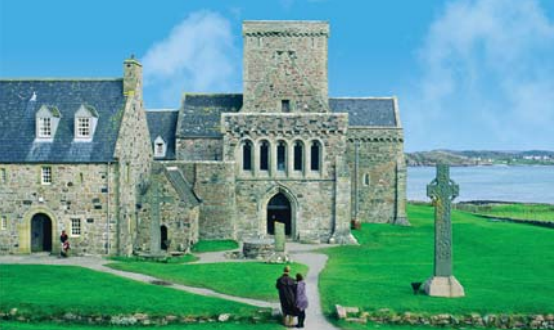
Tour Iona Abbey, Scotland's holiest place since the sixth century A.D. and traditionally believed to be where the Book of Kells was created.

PRSR STD U.S. Postage PAID Gohagan & Company