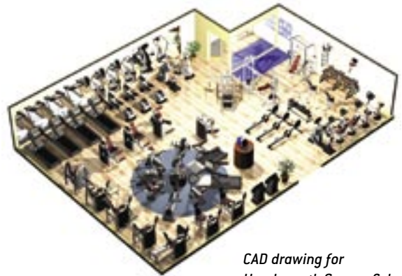
CAD drawing for Handsworth Grange School

In order to create an atmosphere conducive to exercising and learning, design should create a stimulating, familiar environment in which to work out. Technogym® provides advice on the best usage of space and equipment layout. 2D technical drawings and 3D computer generated visuals with animated 'walk-throughs' can be supplied at an early stage to help with the planning process. Design consultants are also on-hand to provide valuable input into all aspects of facility safety and accessibility.