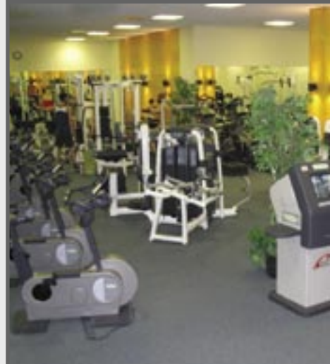
University of Hamburg - Germany