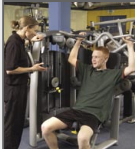
Sharnbrook School - UK