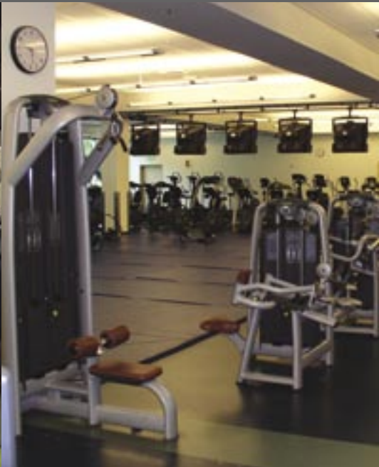
University of Washington - USA