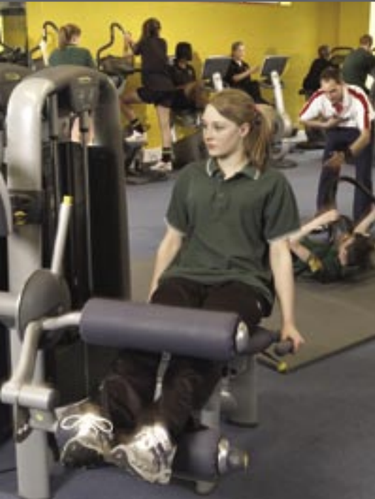
Sharnbrook School - UK