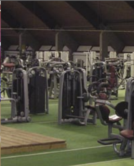
Kiel University - Germany