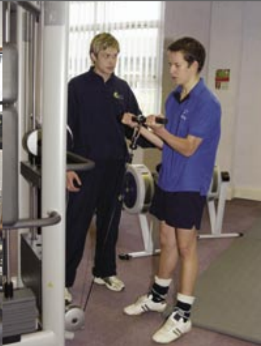
Handsworth Grange - UK