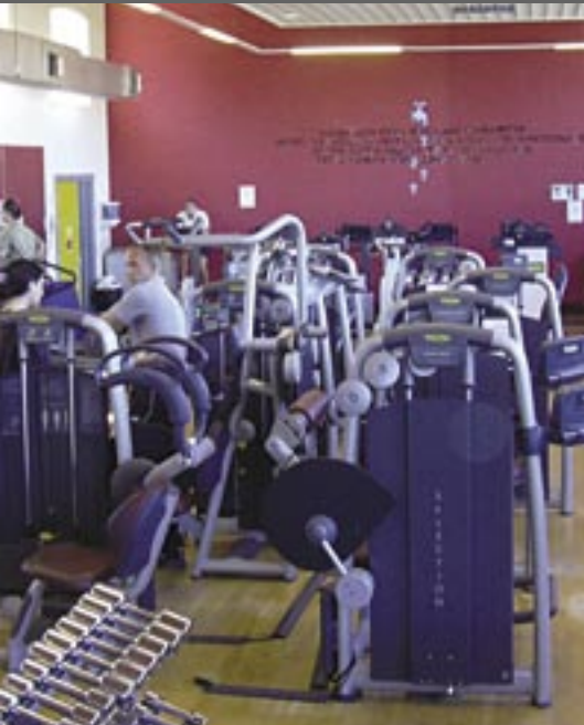
Loughborough University - UK