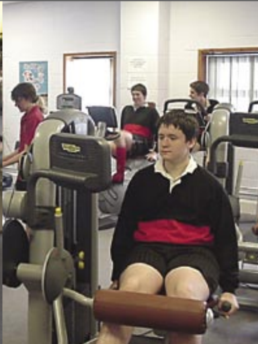
Sleaford Carres Grammar School - UK