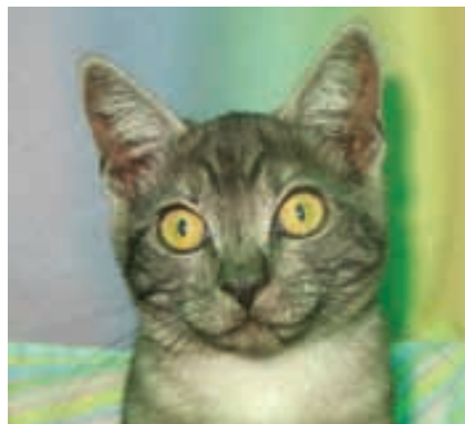
Slate adopted by Tamarind Harmon who also adopted Perla