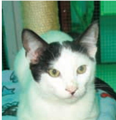
Braveheart is a new RESQCATS resident cat