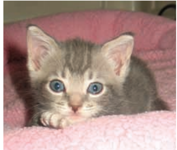
Pocket "Wishes everyone a Happy Holiday!"

WE ARE PROUD TO DONATE OUR TIME & DESIGN SKILLS TO SUCH A WORTHY CAUSE!