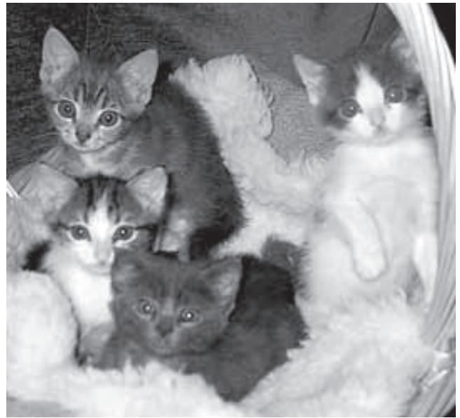
A foster litter.... it would be hard not to get attached to these!

My next foster kitten was Pocket. He was a male kitten that had lost two siblings already. They came from a litter of 5 and had been born with neurological issues. They had difficulty walking and balancing. The two bigger brothers gradually they grew out of the condition, but Pocket was not doing as well. He was so tiny and could not walk. When he tried, he would topple forward as his head was bigger than the rest of his body. I taught him to walk by creating a harness out of gauze and tying it under and around his belly. I hand fed him and did basically everything I could think of to