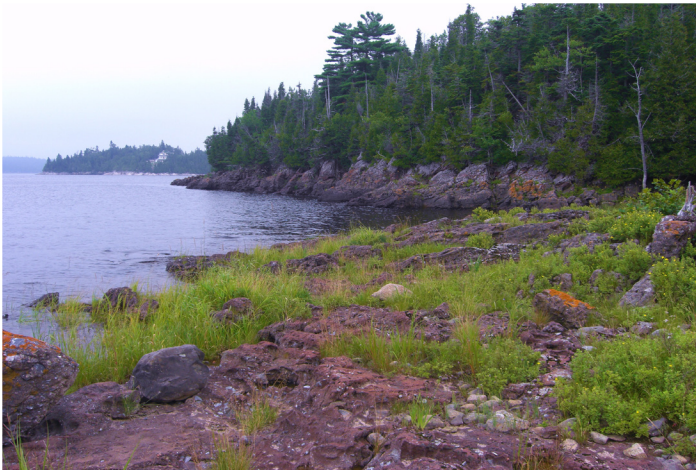
The St. John River waterfront on the new Boar's Head Nature Preserve