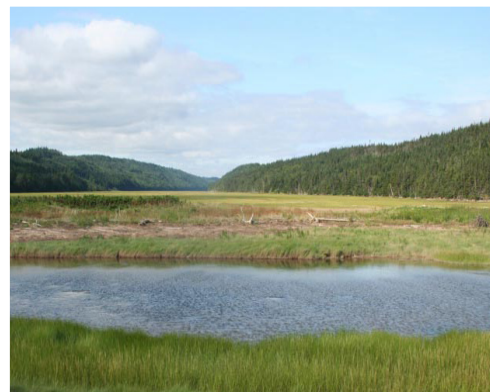
Precious salt marshes, like this one at the Cape Enrage Marsh Nature Preserve, could be completely submerged with expected sea level rise.