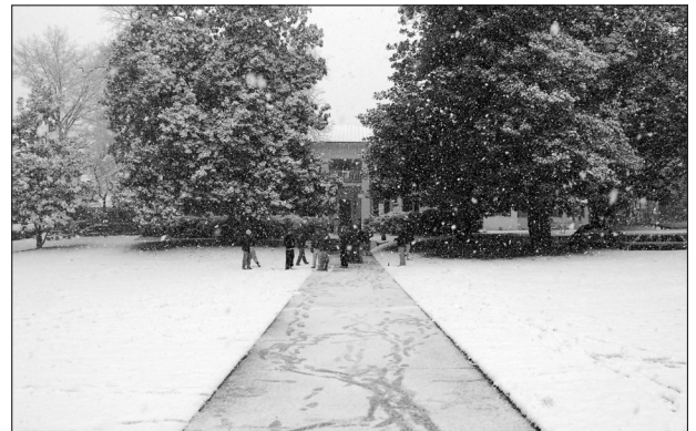
In January, snow greeted brothers returning to campus and provided an entire week off from school after Athens was pounded with more than eight inches of snow. The Monday after the snow fell saw undoubtedly the biggest and longest snowball fights in the history of Georgia Beta and a party that lasted into the weekend. It was a great start to the semester.