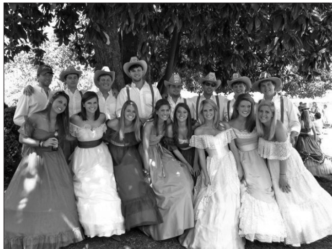
Georgia Beta brothers and their dates at Magnolia 2010