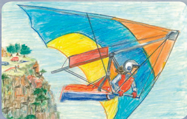
3rd Place Winner - Junior, USA

Once received, entries become (and remain) the property of the State Sponsor and may be used for a variety of purposes. Those forwarded for international judging become (and remain) the property of the Federation Aeronautique Internationale (FAI).