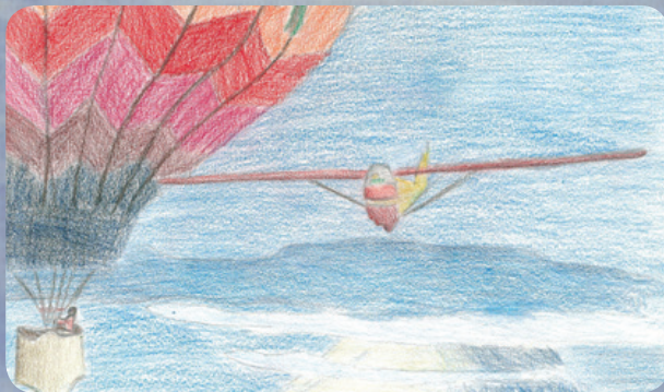
1st Place Winner - Junior, USA

Now, it's your turn to think about all the ways people travel through the sky with the power of the wind alone. Grab your favorite colored pens, pencils, or paint and create a poster celebrating the wonder that is Silent Flight.