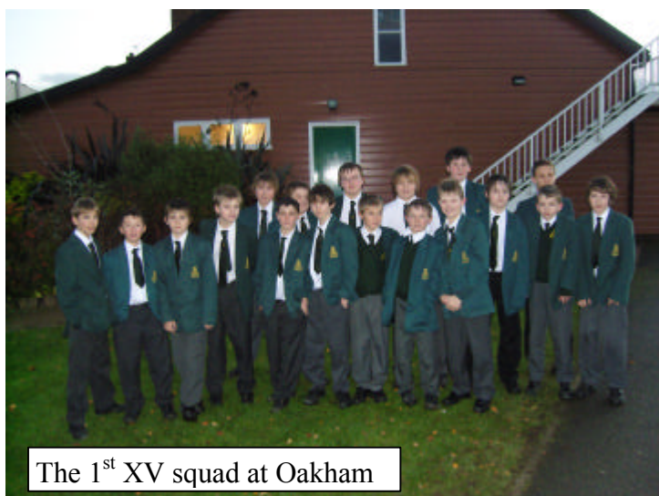
The 1 st XV squad at Oakham

We started well with some strong drives but could not convert the possession into points as we were too far out from their line and each time we got close we managed to drop the ball. After weathering the early storm Oakham regrouped and started to get a good percentage of possession and exhibited some sound, low driving ruck play which earned them a lot of second phase ball; this possession led to two first half tries. After a quick team talk to regroup the side and ensure they focused on the basic skills they came out with more focus in the second half and despite conceding a further try the side soon started to gain