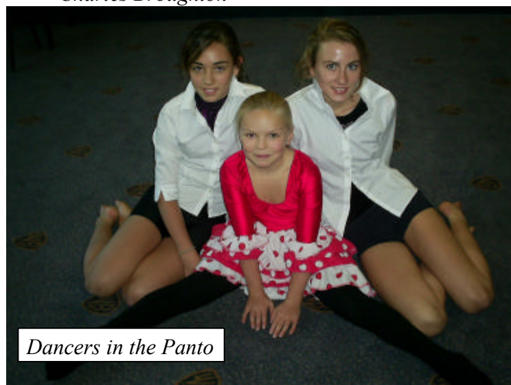
Dancers in the Panto