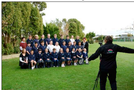
Room 11 doing their best "cheese" impressions...