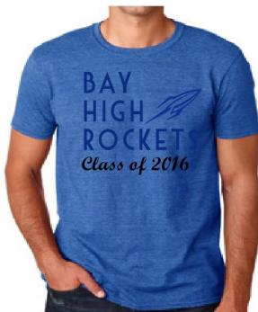
Class Roster on Back