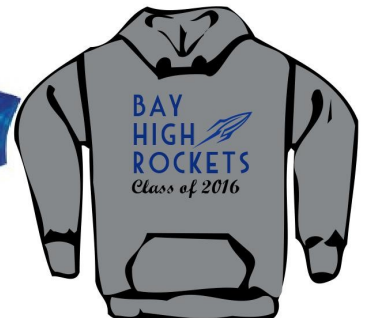
Front Logo only