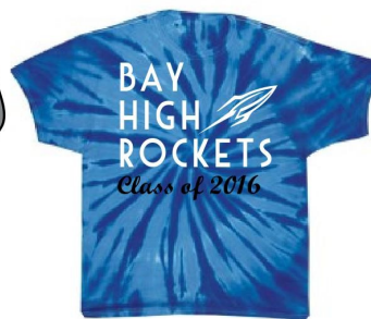
Class Roster on Back