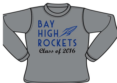
Class Roster on Back