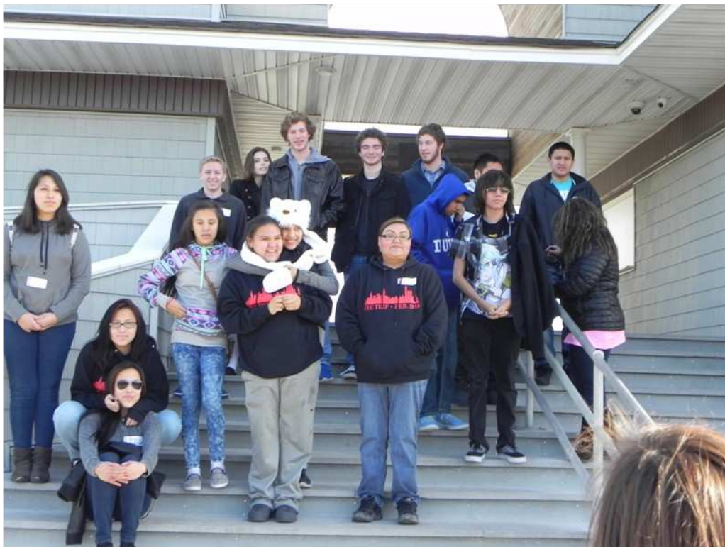
Rogers Beach—February 21, 2016