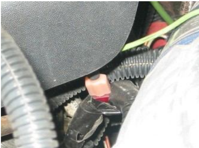
ICP Splice on BL/GR wire (Figure 3)