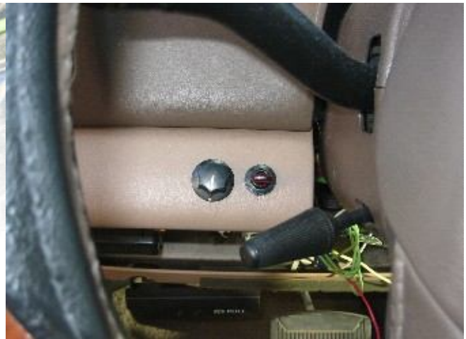
Dial (Figure 4)