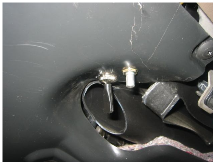
Mounting Location on bottom Panel for Excursion