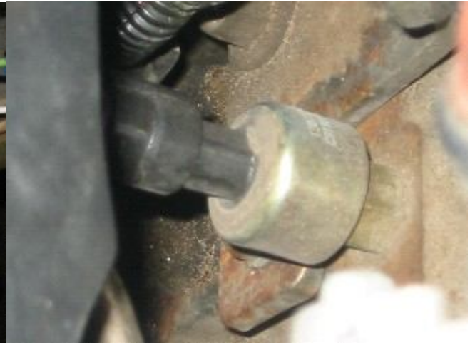
ICP (Figure 2)