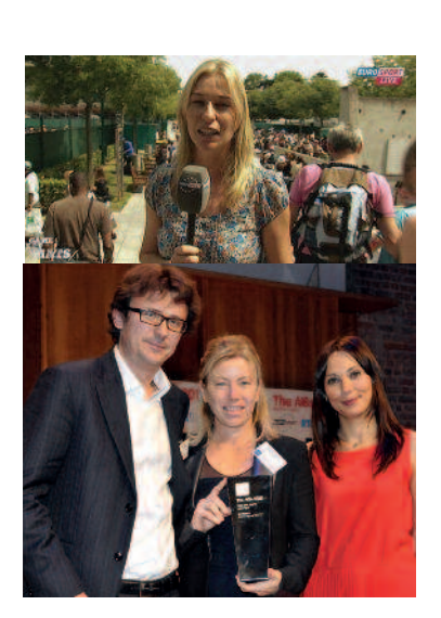
Eurosport took the 2012 AIB prize for best live sports coverage for Roland Garros 2012