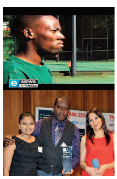
The Story of Lucas Sithole produced by eNCA in South Africa was the winner in 2012