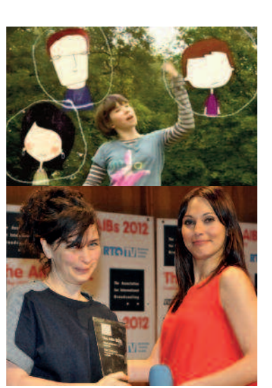
BBC Newsround won the 2012 best children's factual award for its special My Autism and Me