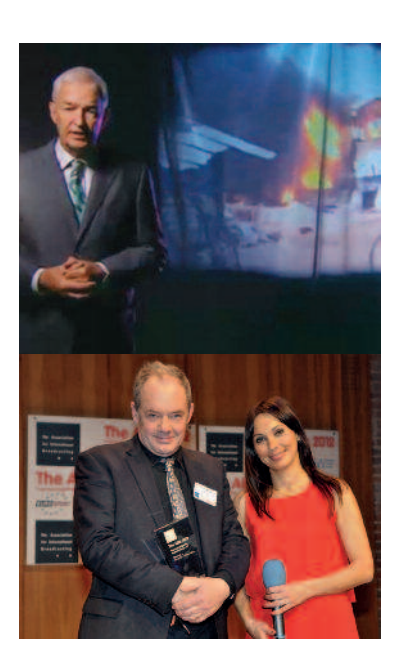
2012 TV winner Channel 4 for Sri Lanka's Killing Fields