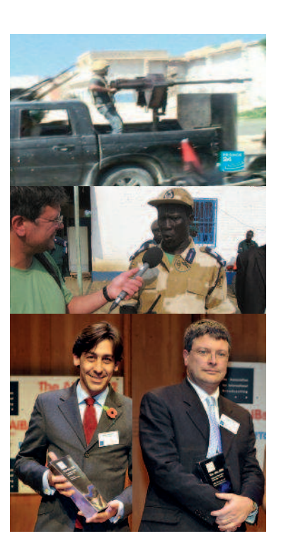
2012 winners For television France 24 and for radio BBC World Service