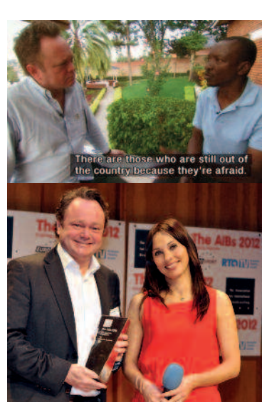
TV2 Norway took the specialist programme award in 2012 for Dining with the Enemy