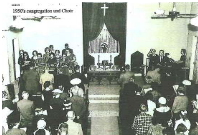
1950's congregation & choir lift their voices in song.