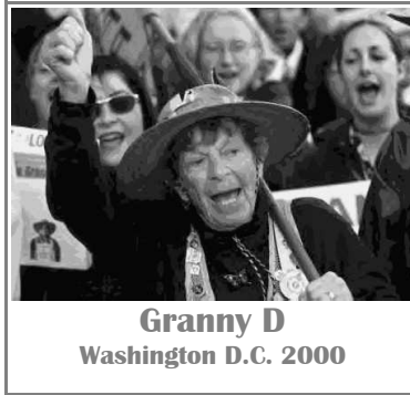
Granny D Washington D.C. 2000

COMMON CAUSE provided assistance for her courageous coast-to-coast walk.