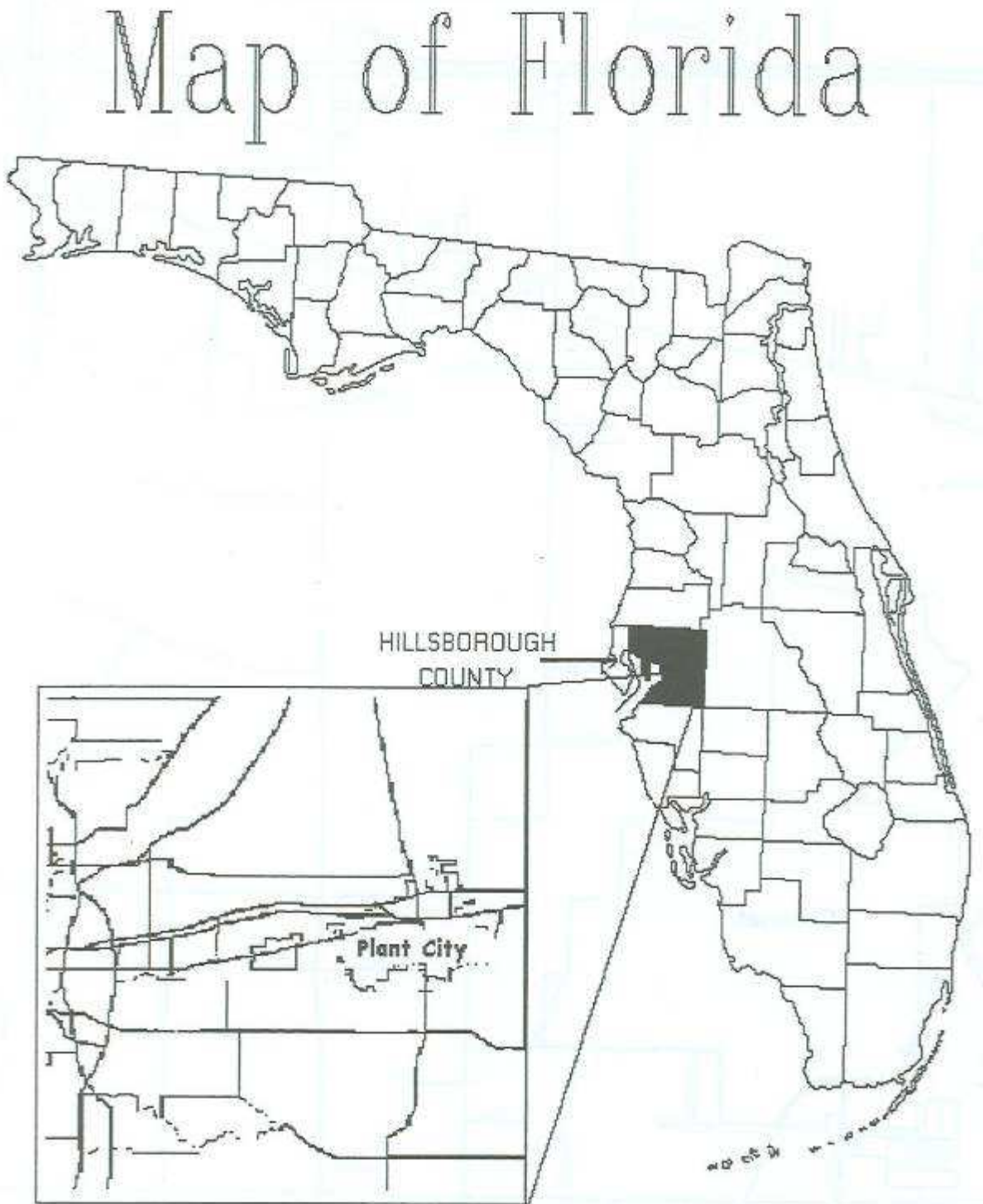
Figure 2: Plant City in Hillsborough County, FL