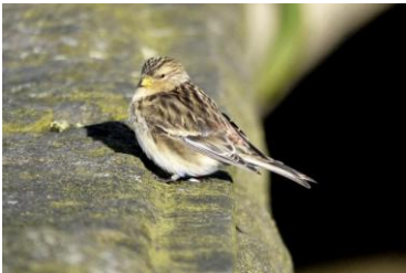
Twite, Warley Moor

Can you find these hidden words relating to the Twite - all of which appear in this article? They run upwards, downwards, side to side and diagonally.