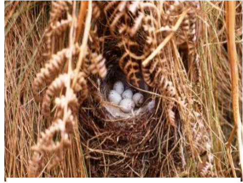
Twite nest lined with sheep's wool and feathers

Moorland Fires, either managed moorland burning, that has become out of control, or accidental fires caused by discarded cigarettes, campfires that have not been properly extinguished, or sunlight on glass, are another hazard for Twite because they nest in mature heather or bracken, which take several years to recover after burning. Other birds affected by these fires include Golden Plover, Dunlin, Curlew, Short-eared owl, Skylark, Red Grouse and Meadow Pipit. The legal burning season ends on 15 th April to protect these moorland breeding birds.