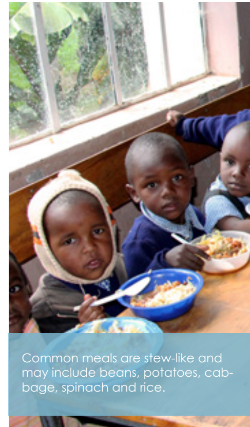
Common meals are stew-like and may include beans, potatoes, cabbage, spinach and rice.

The feeding program at the Camp Brethren Christian School (CBCS) is designed to provide every student with two well-balanced meals. Each day, students receive a morning porridge and lunch prepared in the onsite kitchen. With the number of students fed daily exceeding 300 in 2014, it was critical to have access to fresh water. The 2011 funding of a hydro-thermal solution and the 2012 construction of a 500,000 liter water tank allowed CBCS to be prepared for the increased demands of adding new students in 2014.