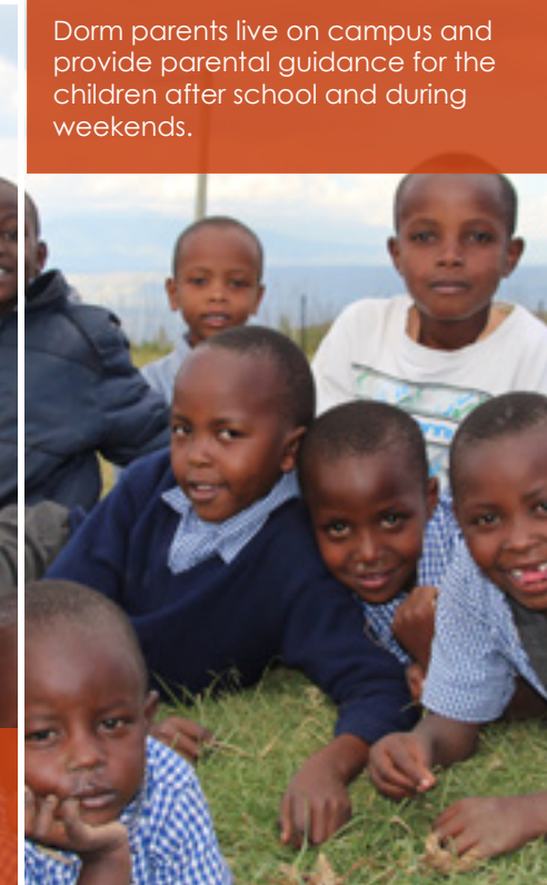
Dorm parents live on campus and provide parental guidance for the children after school and during weekends.