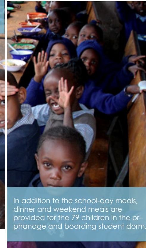
In addition to the school-day meals, dinner and weekend meals are provided for the 79 children in the orphanage and boarding student dorm.