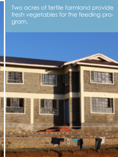
Two acres of fertile farmland provide fresh vegetables for the feeding program.