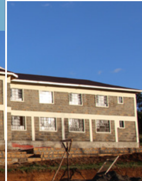
The school dorm provides housing for tuition-paying boarding students and a new revenue stream to help promote future self-sustainability.