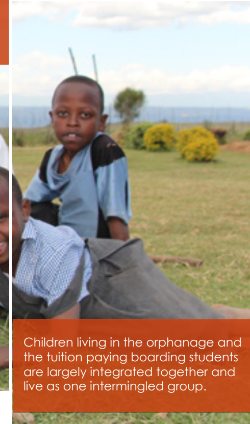
Children living in the orphanage and the tuition paying boarding students are largely integrated together and live as one intermingled group.