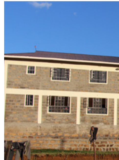
Infrastructure investments in bio-fuel and clean running water have aided in making CBM more self-sustaining.

Early investments in support of the sustainability model focused around agriculture. In 2014, tuition-paying boarding students continued attending Camp Bretheren Christian School, which is an important component to advancing the mission of self-sustainability. Additionally, plans are in development for on-campus sewing business to earn additional revenue and cut down on costs of replacement uniforms.