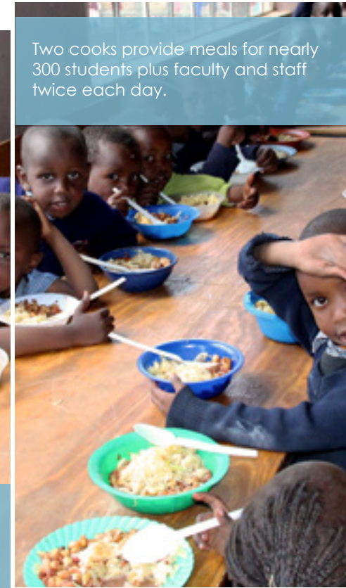
Two cooks provide meals for nearly 300 students plus faculty and staff twice each day.